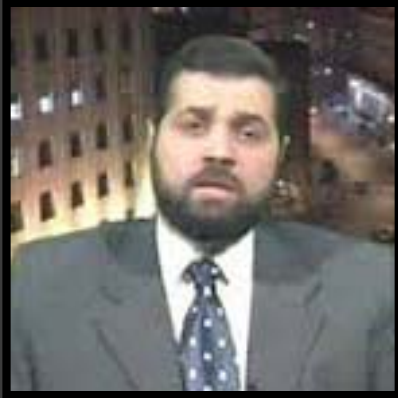
Osama Hamdan HAMAS Leader, Beirut, Lebanon U.S. Specially Designated Global Terrorist in 2003